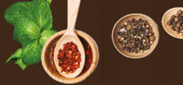
Gaeng Daeng Ped