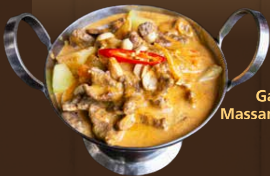
Gaeng Massamun Beef