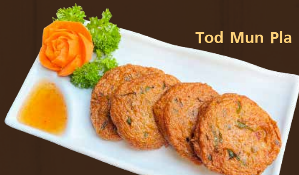
Tod Mun Pla

Kai Look Keuy | Son In Law Eggs 17.9 Hard boiled eggs, deep fried for a crispy outer shell & topped with tamarind sauce, fried shallots & coriander