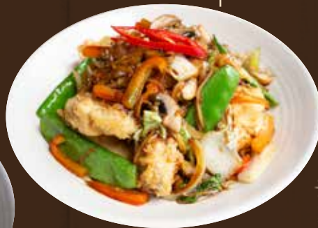
Pla Lard Khing