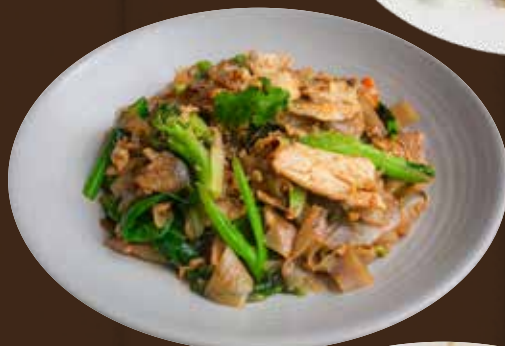
Pad See Ew