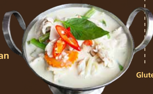
Gaeng Keow Waan