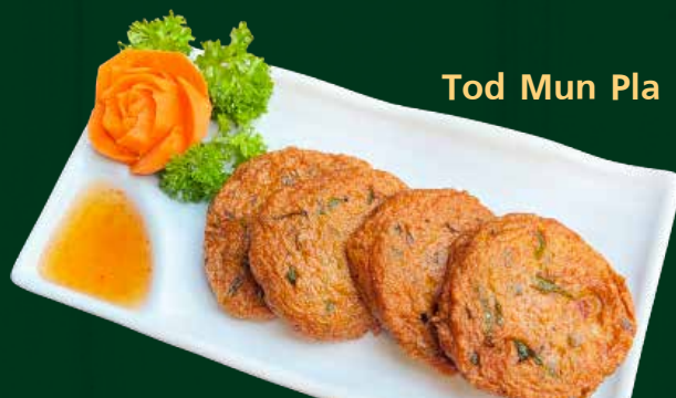
Tod Mun Pla

Kai Look Keuy | Son In Law Eggs 17.9 Hard boiled eggs, deep fried for a crispy outer shell & topped with tamarind sauce, fried shallots & coriander