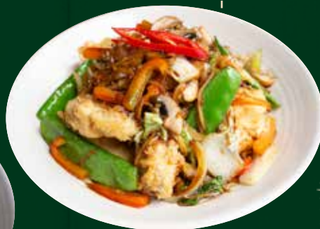
Pla Lard Khing