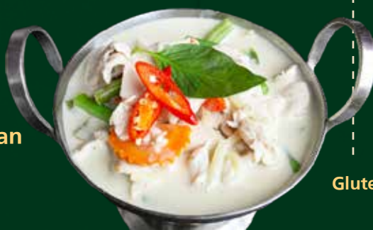
Gaeng Keow Waan