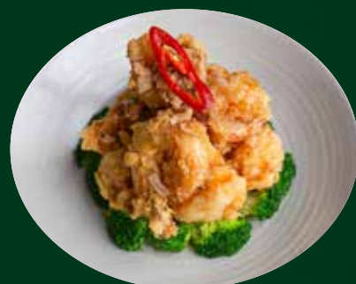
Goong Ma Karm