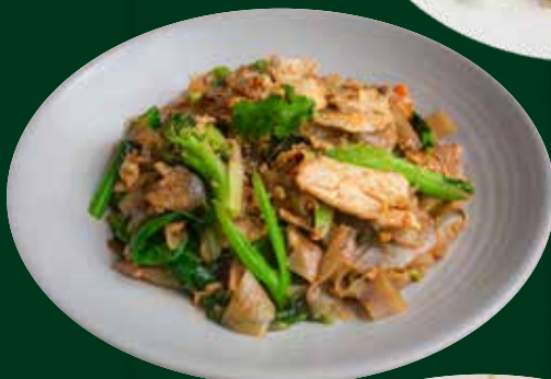
Pad See Ew