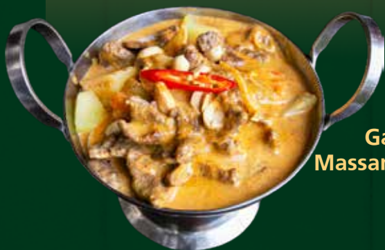
Gaeng Massamun Beef